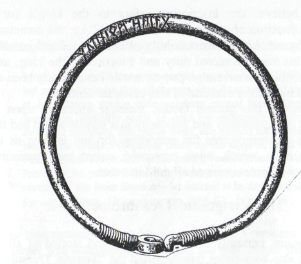
Plate 4.1: The Ring of Pietroassa

An old drawing of the ring preserves for us the general shape and design of the object, shown in plate 4.1. This reveals that the rune inscriptions was carved to sit across the throat of the wearer. It unclear as to whether the runes would have been visible to observe when the ring was being worn. I would guess that the inscription we made to be hidden, as an operative message to forge a sacred line between the king/chieftain and the gods and the people.