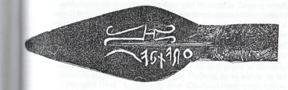
Plate 5.2: The Spear of Dahmsdorf

Again, reading from right to left, we have a noun-agent name of the spear ran(n)ja: "the runner," or "the one which causes (them) to flee." In the case of "the runner," it is meant in the sense of "to run someone, or something, through." This is also probably an East Germanic form, but the archeological and art-historical context make the Germanic origin of the piece more certain. Its location indicates that it might have belonged to a Burgundian.